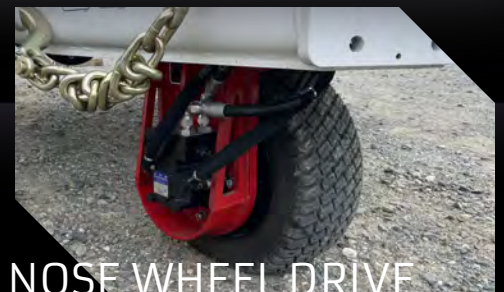
NOSE WHEEL DRIVE